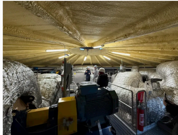
Inside the world's largest sand battery.

The world's largest sand battery doesn't have a copper top. It doesn't really look like a battery. But it stores 100 megawatt-hours of energy, delivers 1 megawatt consistently, and has slashed a rural Finnish town's carbon emissions by 70%, cutting 160 tons of carbon dioxide emissions annually. And it's about to lose its title as the world's largest sand battery, because the company that made it is building another one, twice its size.